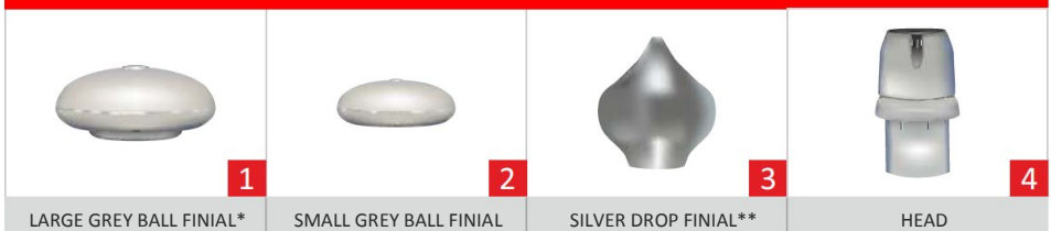
LARGE GREY BALL FINIAL*