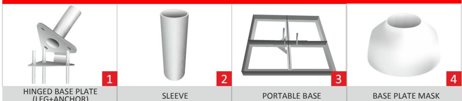
HINGED BASE PLATE (LEG+ANCHOR)