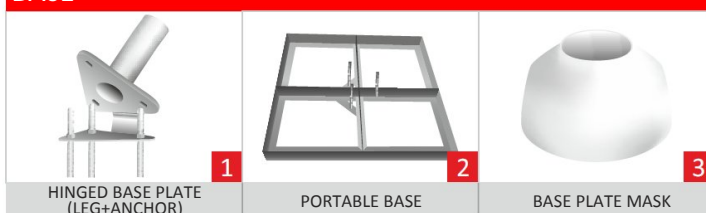
HINGED BASE PLATE (LEG+ANCHOR)