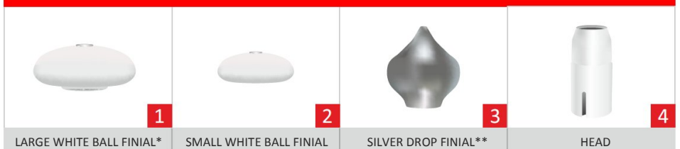
LARGE WHITE BALL FINIAL*