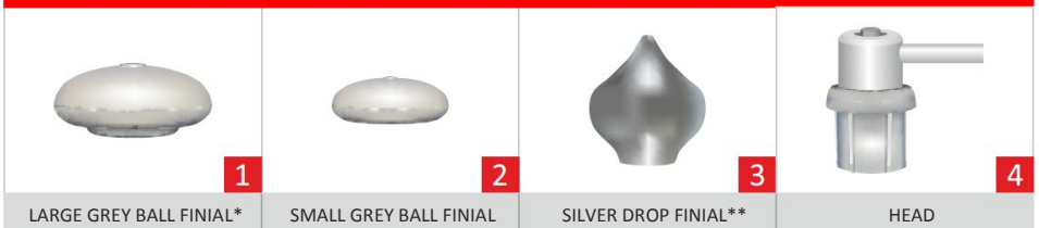
LARGE GREY BALL FINIAL*