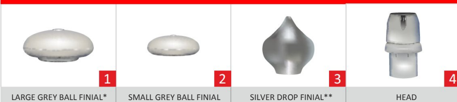
LARGE GREY BALL FINIAL*